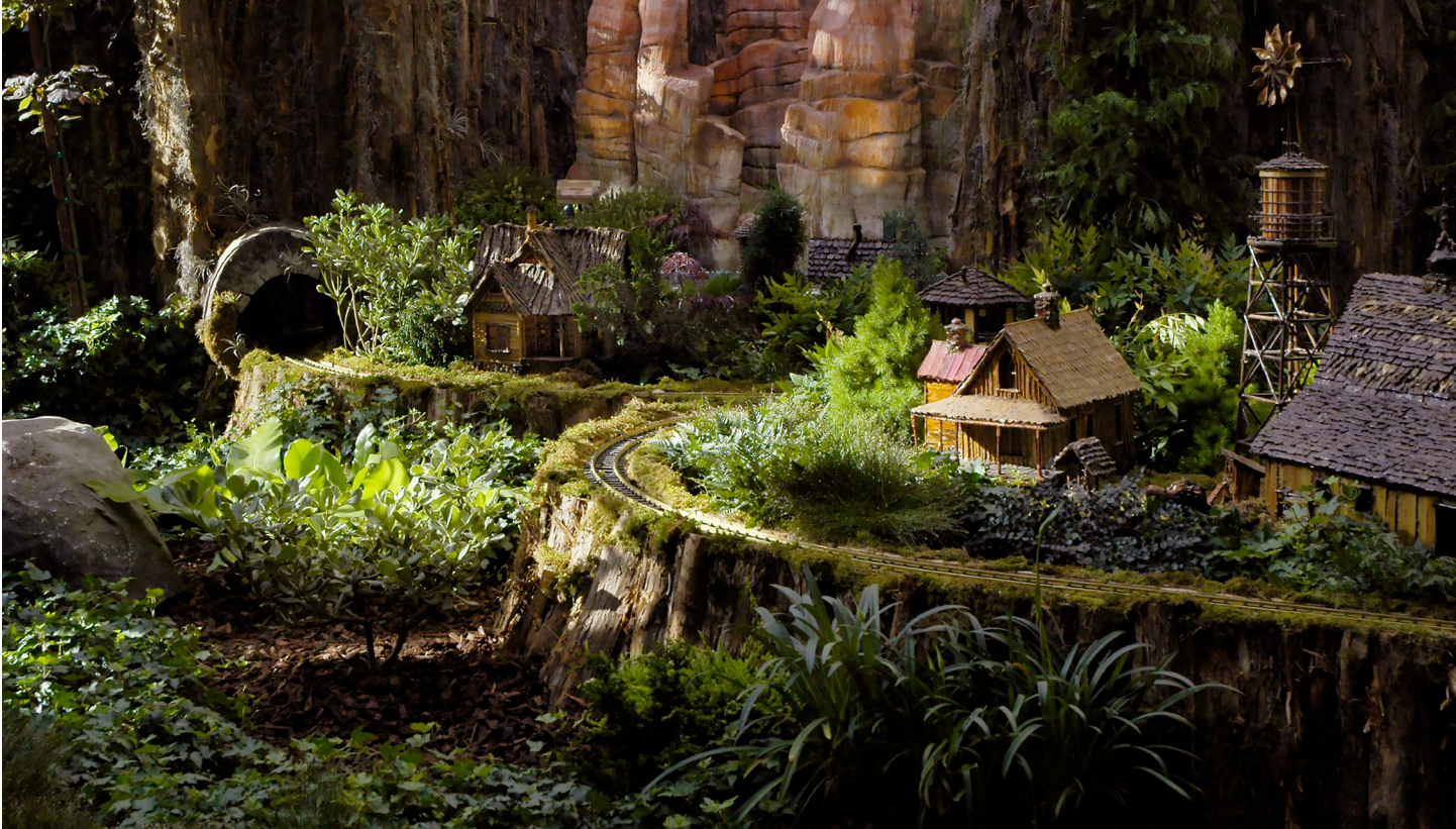
Rural scene at Bellagio Conservatory, Las Vegas, NV