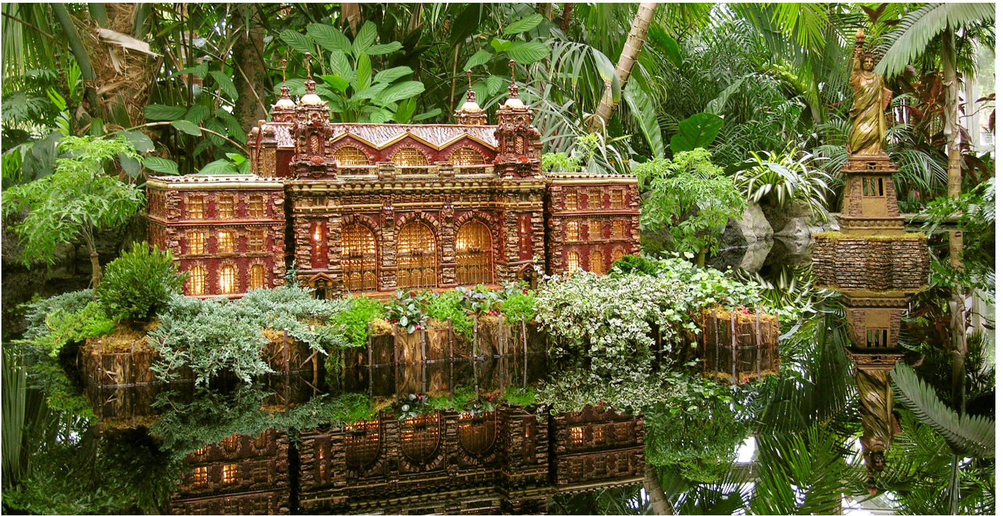
Ellis Island and Statue of Liberty at New York Botanical Garden, Bronx, NY