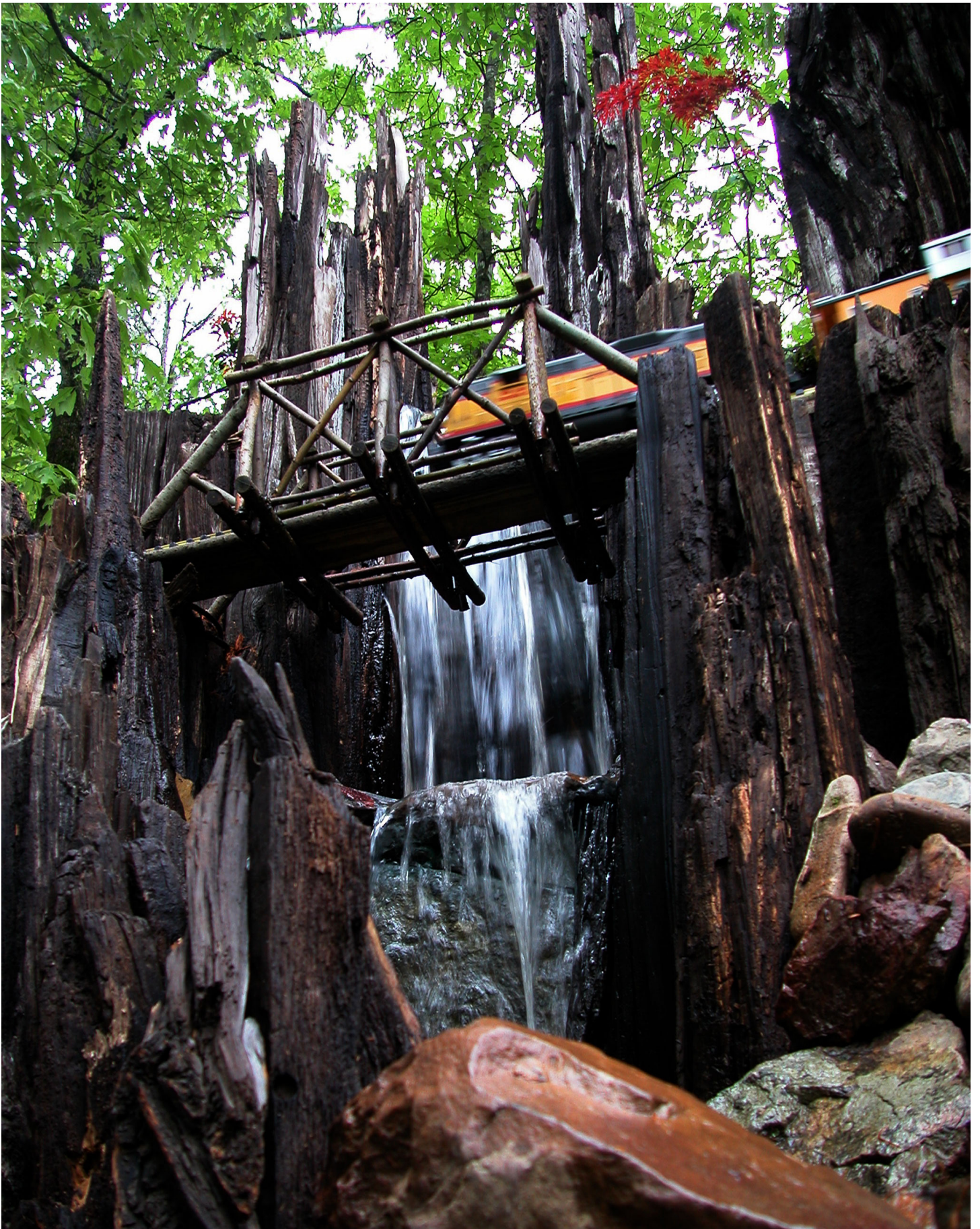
Residential Garden Railway