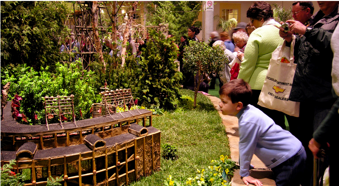
Wrigley Field at Chicago Flower Show