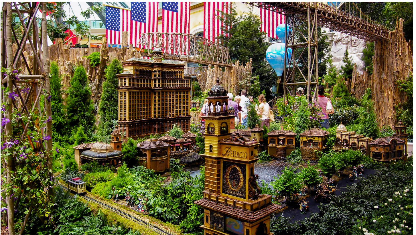
Bellagio Conservatory model at Bellagio Conservatory, Las Vegas, NV