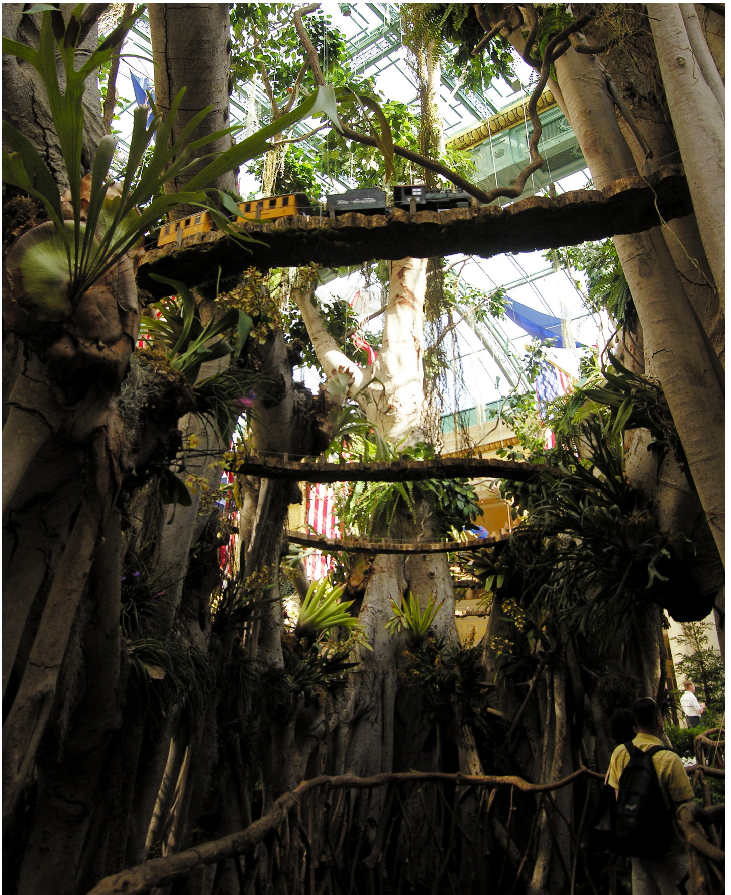
Train tracks in Banyan Tree at Bellagio Conservatory, Las Vegas, NV