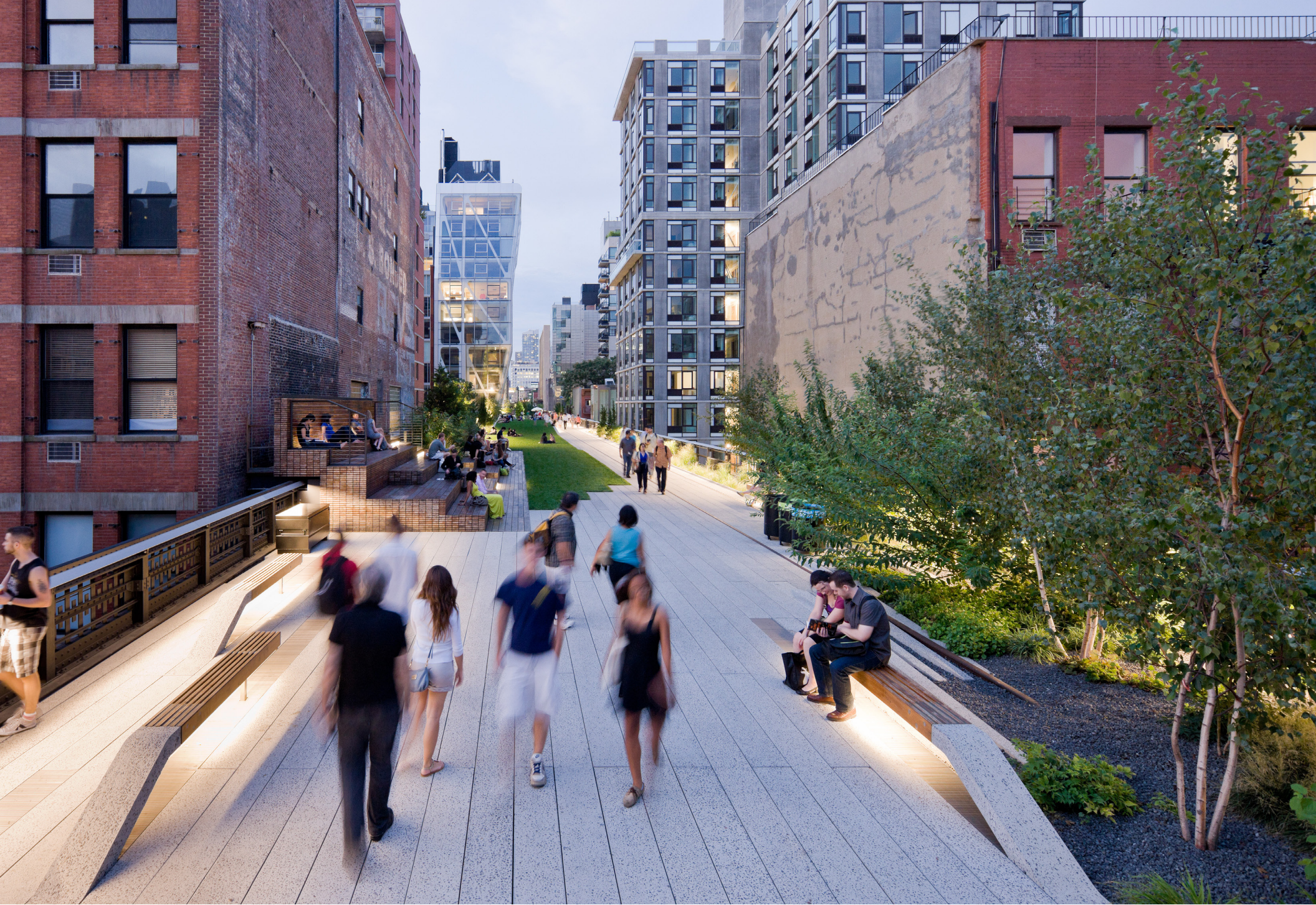
The High Line, New York, NY 2004–present (2009, 2011, 2014, 2019) ASLA Honor Award 2011, 2013