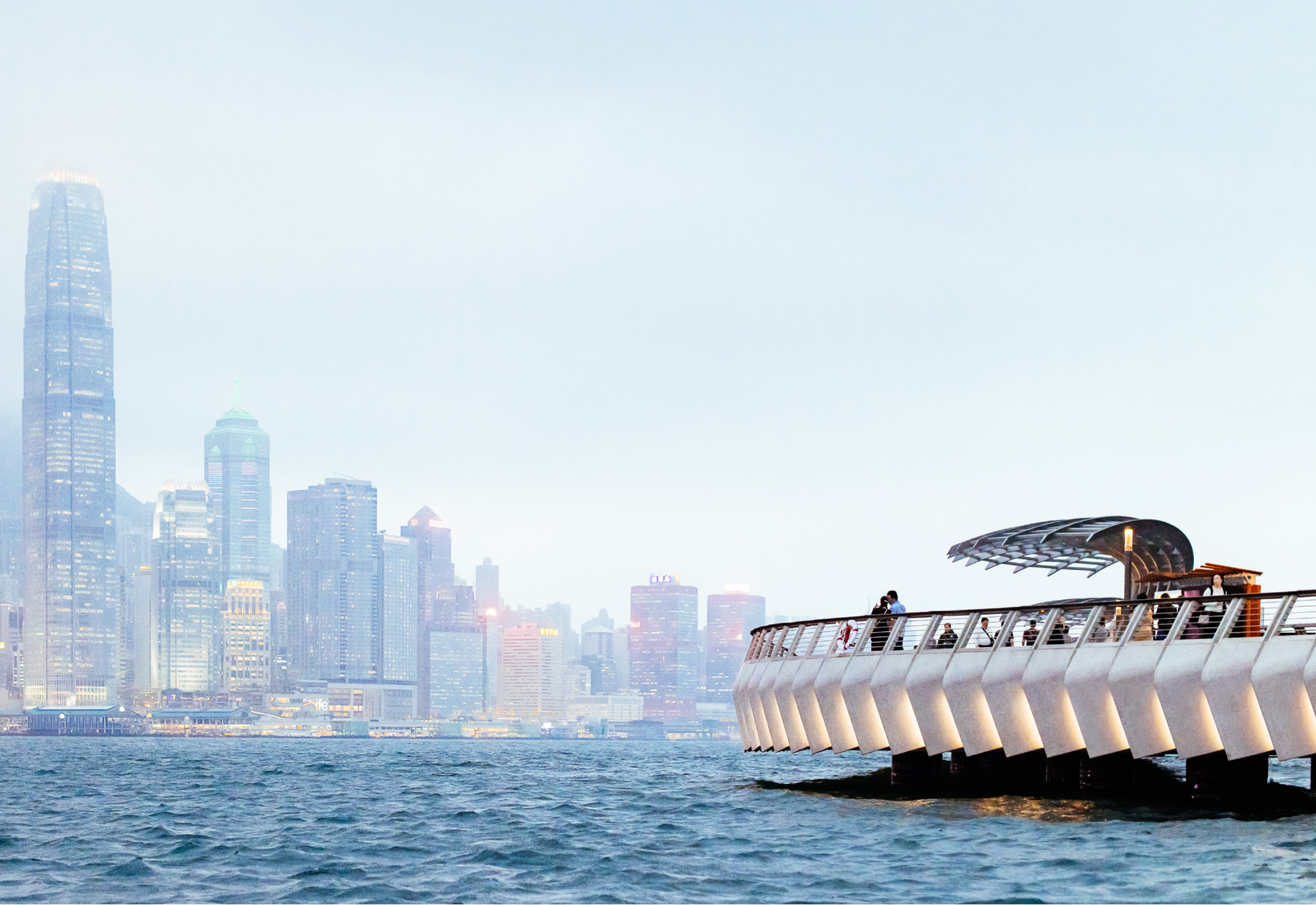
Victoria Dockside, Hong Kong, China 2019