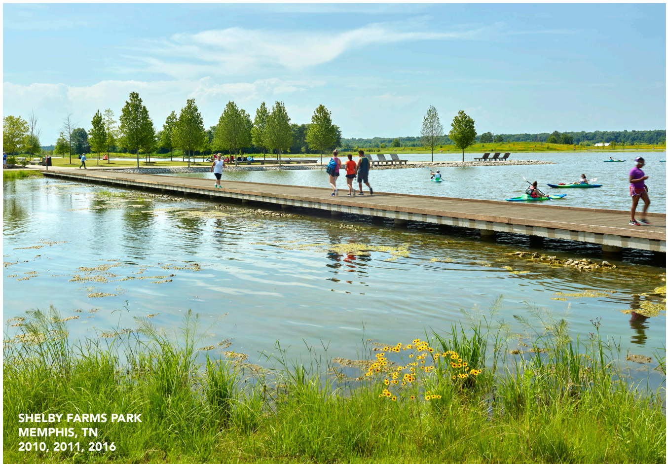
SHELBY FARMS PARK MEMPHIS, TN 2010, 2011, 2016

"James Corner Field Operations has achieved national, if not international, stature with signature projects such as New York's High Line, Santa Monica's Tongva Park, and Chicago's Navy Pier. What impresses me is the depth inside the firm; it is not just one leader but an exceptionally talented and committed group of professionals."