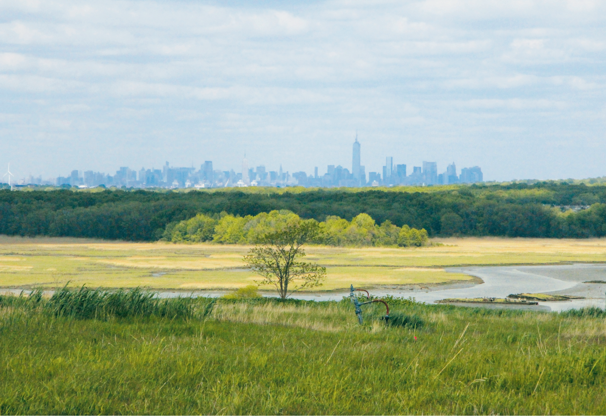
Freshkills Park, Staten Island, NY 2004–present

“Freshkills, once a daily dumping ground, will become a showcase of urban renewal and sustainability.” —Michael Bloomberg, Former Mayor of New York City