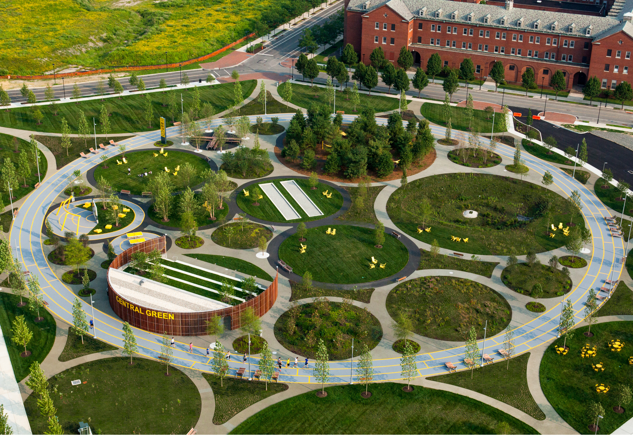
Navy Yards Central Green, Philadelphia, PA 2015

"This unique environment has become one of the nation's leading places to work, creating even more reasons for innovative companies from around the world to move to Philadelphia." —Michael A. Nutter, Former Mayor of Philadelphia