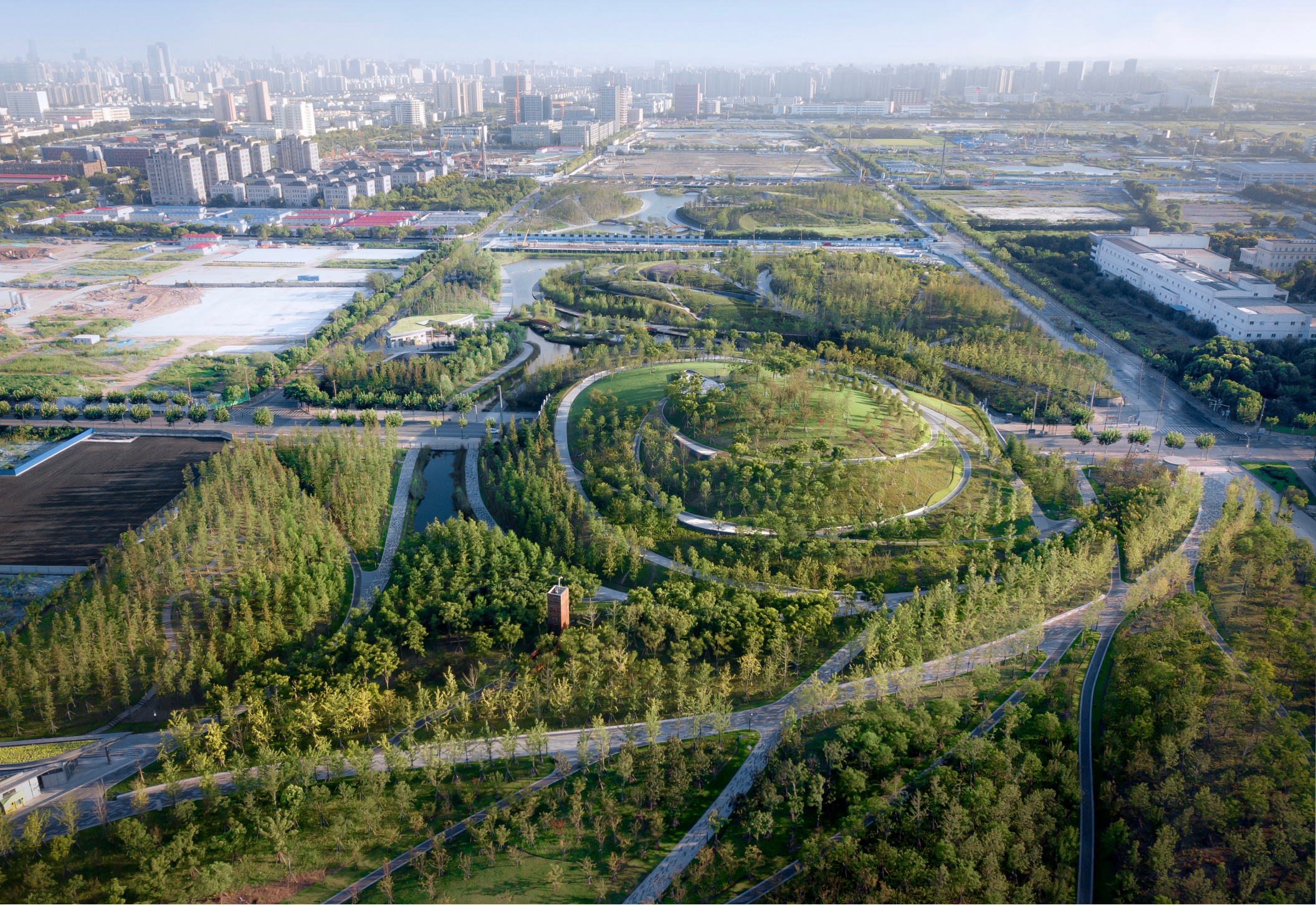
Taopu Central Park, Shanghai, China 2019

"It is not only a beautiful garden, but a big sustainable ecological system as well. It will serve as an urban 'green lung.'" —Xu Wei, Shanghai Daily