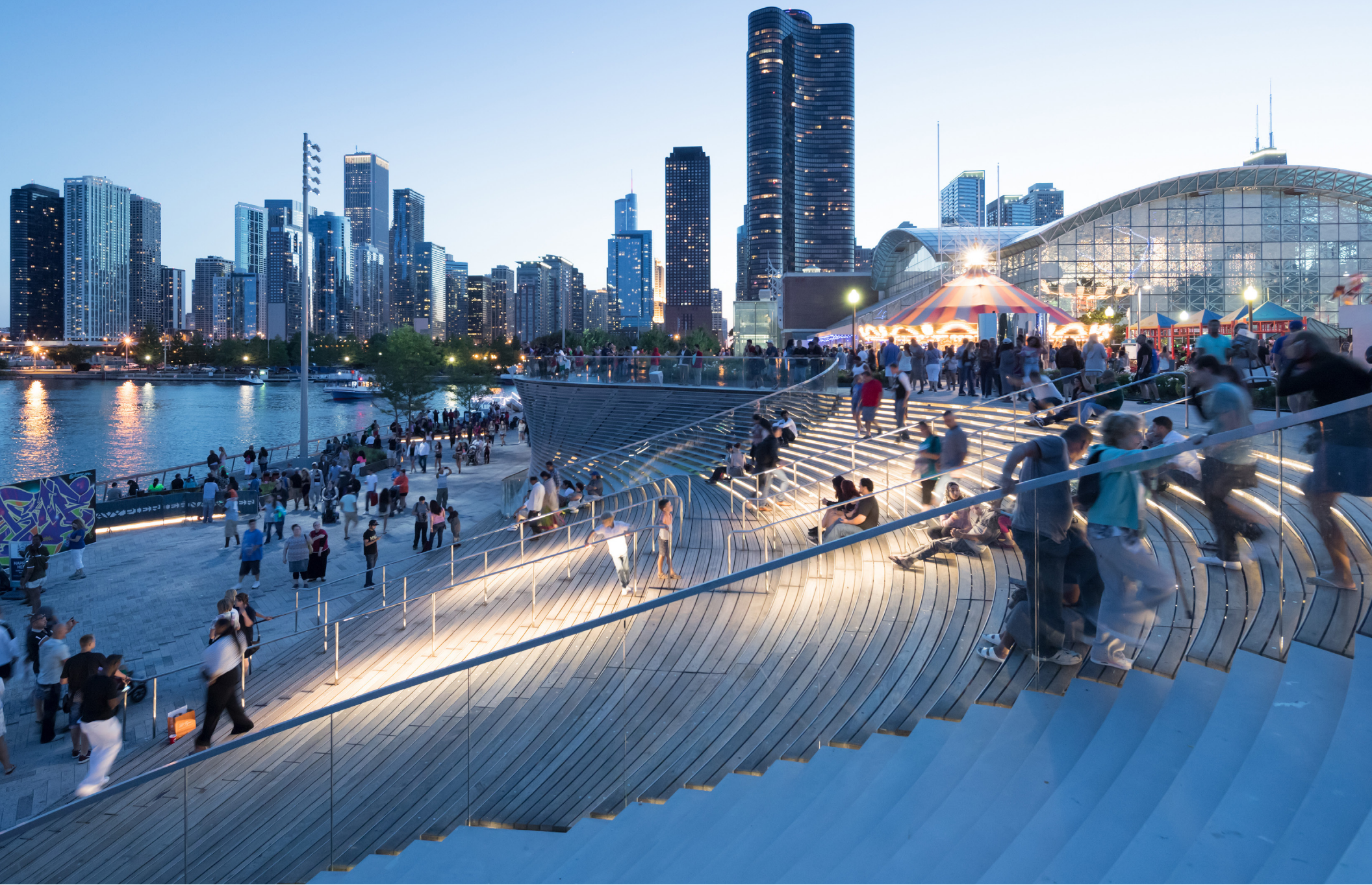
Navy Pier, Chicago, IL 2016, 2017

"The redevelopment of Navy Pier is vital to our ongoing efforts to attract 55 million visitors annually to the City of Chicago by 2020, creating new jobs and injecting millions of dollars into our local economy." —Rahm Emanuel, Former Mayor of Chicago