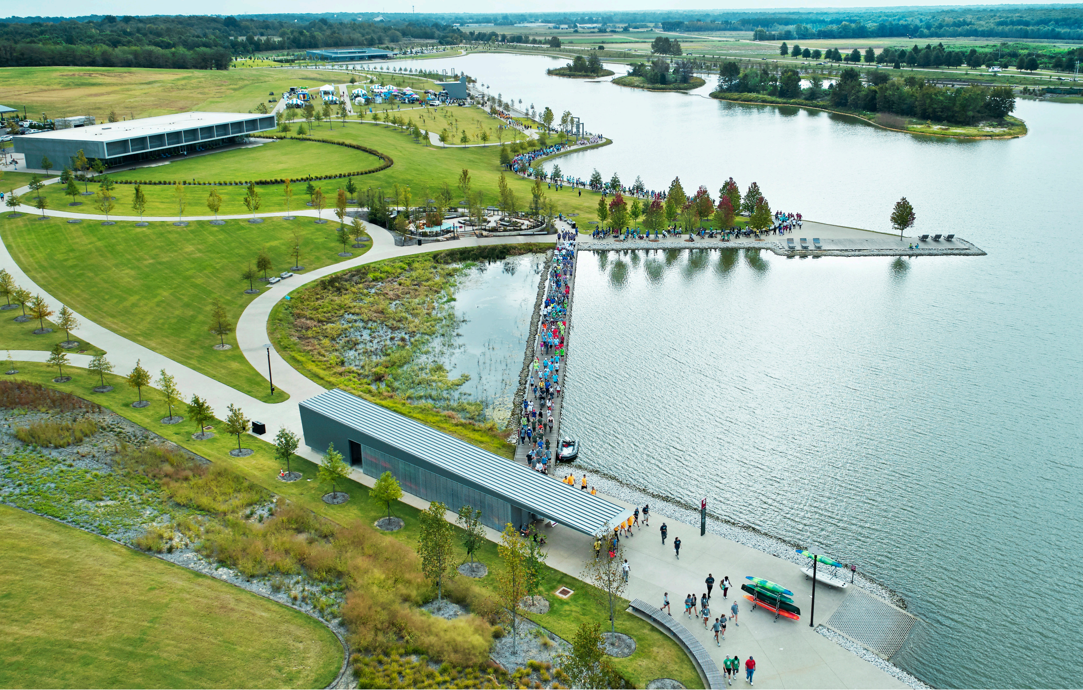
Shelby Farms Park, Memphis, TN 2010, 2011, 2016