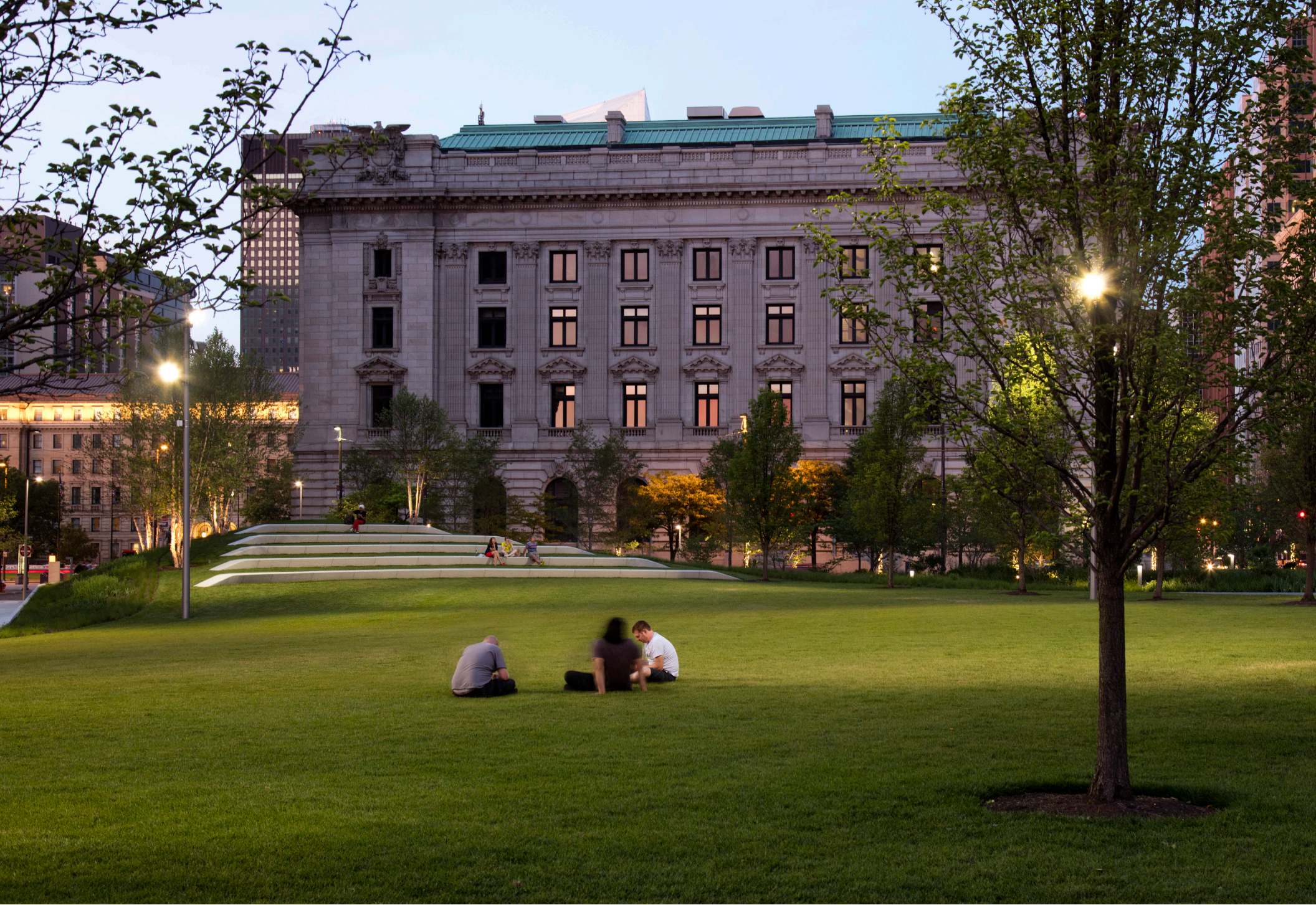
Public Square, Cleveland, OH 2016