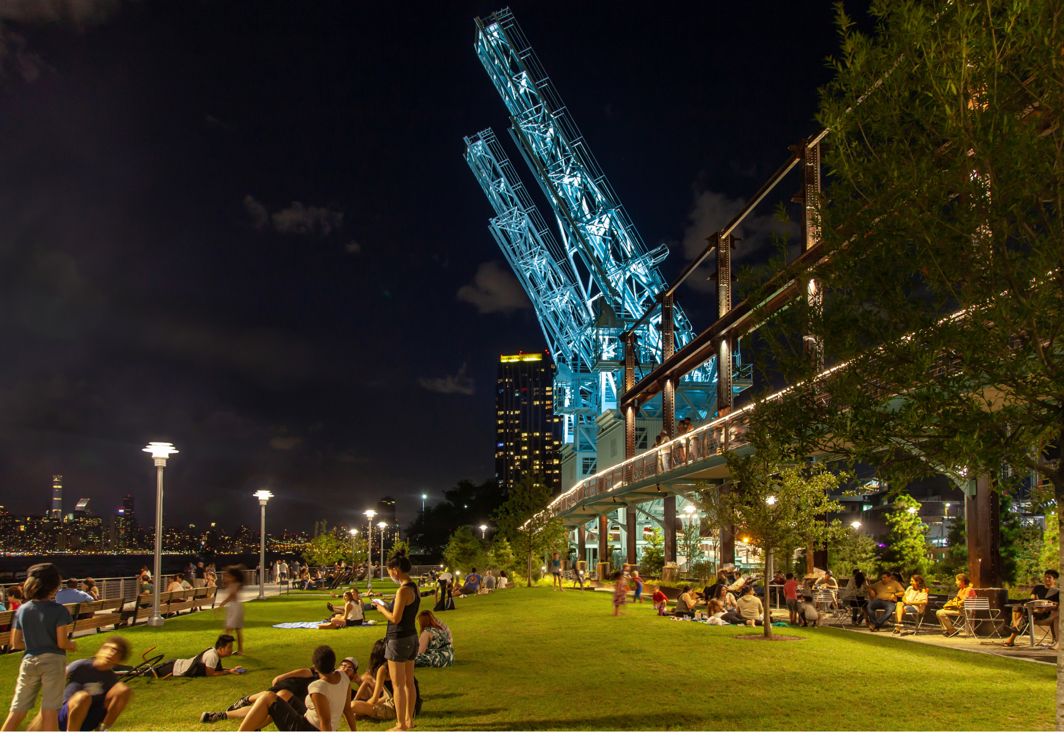
Domino Park, Brooklyn, NY 2018