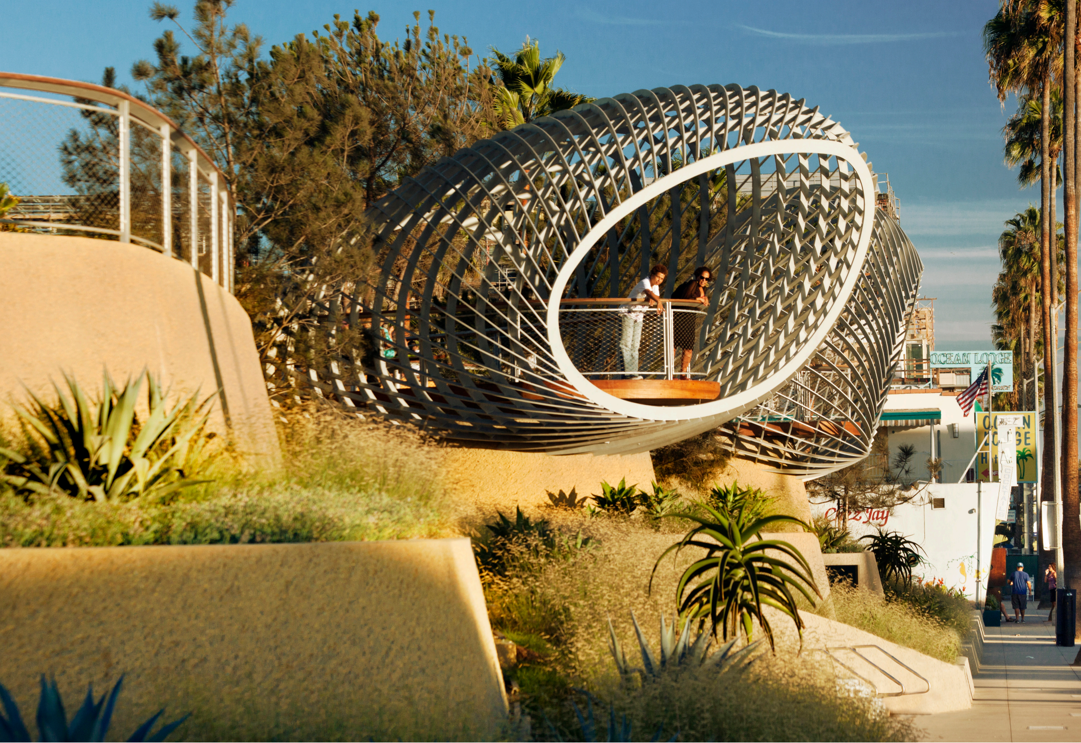
Tongva Park and Ken Genser Square, Santa Monica, CA 2013 ASLA Honor Award 2018